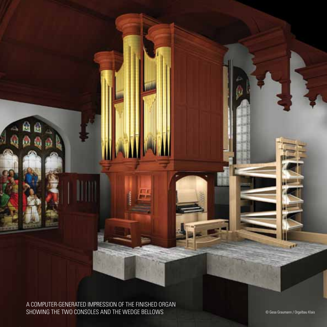
A COMPUTER-GENERATED IMPRESSION OF THE FINISHED ORGAN SHOWING THE TWO CONSOLES AND THE WEDGE BELLOWS