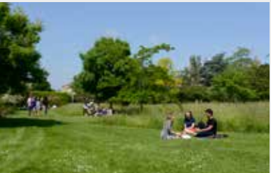
8 Deer Park