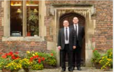
1 Porters Lodge