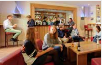
7 College Bar