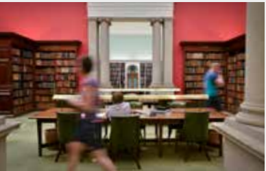
4 Ward Library