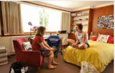
5 Fen Court Accommodation