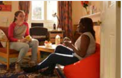
3 Old Court Accommodation