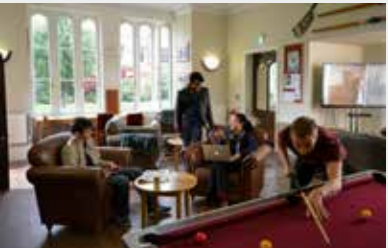
6 Common Room