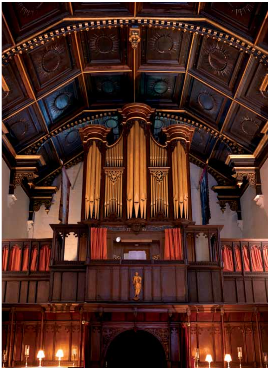
The west end of Peterhouse Chapel showing the pipes and original casework of the Snetzler organ