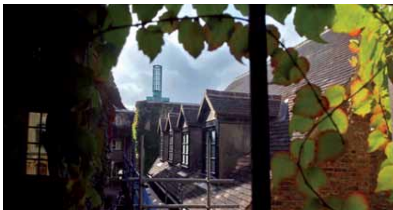
M Staircase under construction