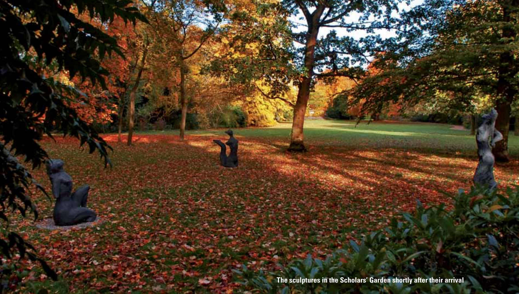
The sculptures in the Scholars' Garden shortly after their arrival