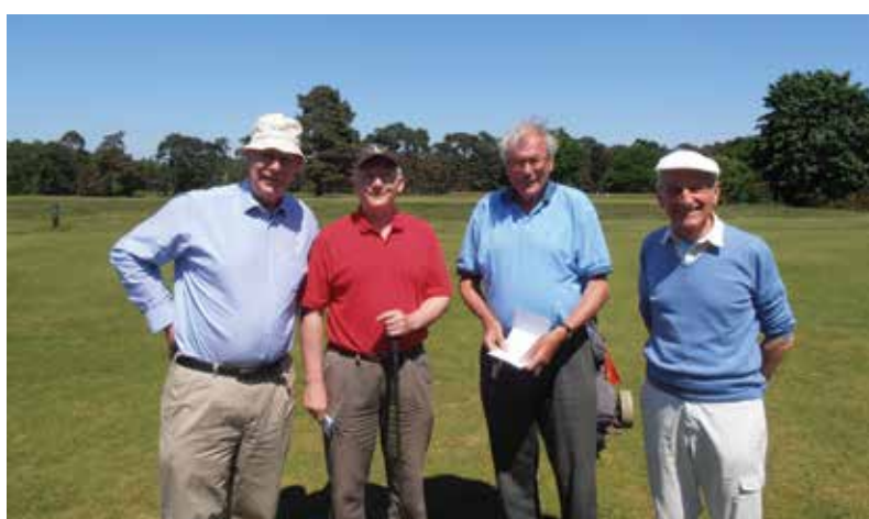
Petrean golfers at Royal Worlington in June.

What we lacked in golfing ability was more than matched by the convivial, jolly atmosphere as well as generous sportsmanship.