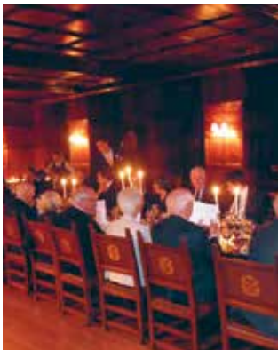
William Stone Society Dinner

The third annual dinner of the William Stone Society was held in October. The dinner was very well attended by those who have remembered the College in their wills together with their spouses and partners. Donations from legacies left to the College in 2013 totalled £817,126.