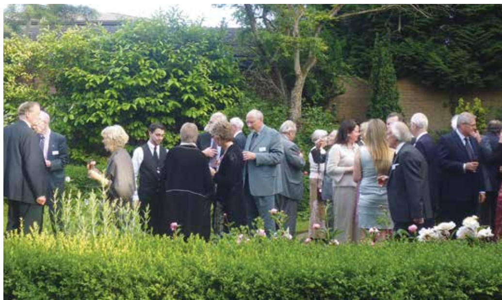
Tea in the Master's Garden at the Gathering.