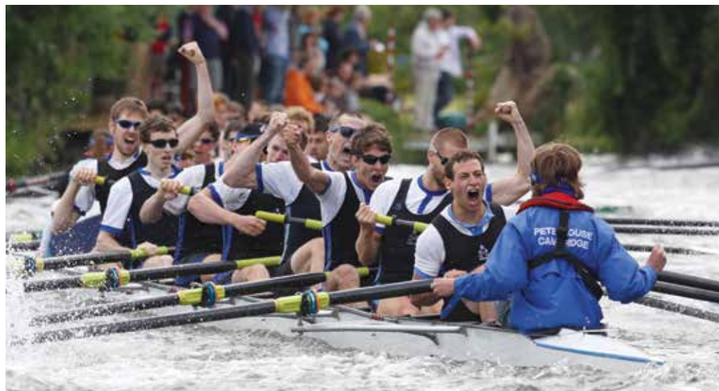
M1 getting their blades.

The Easter Term saw other victories apart from those during the May Bumps. The Men's first VIII had the message boards talking when they easily won their M2 division in Head of the Cam in April, and also happened to be the fourth fastest college boat overall with a time of 8:57. The result from Champs Head further reinforced this: another easy division win from the Men's first VIII with a time of 4:52 which was the second fastest time of the day, just two seconds slower than Downing. The