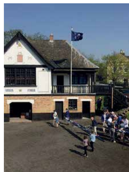
The Boathouse on the day of the new scull launch

The present boathouse was built in 1928 and extended in 1992 and the College would now like to undertake some much-needed refurbishment and a further extension ahead of the Boat Club's bicentenary in 2028. Architects have been appointed and the 2028 Committee, including current and former members of the Boat Club, has met several times to brief the Architects and to discuss their ideas. We are still in the early stages but hope to submit a planning application within the next academic year.