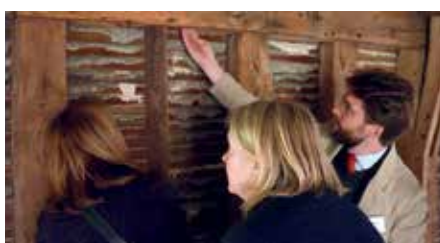
Tunwells Court and Petreans exploring the Brewhouse