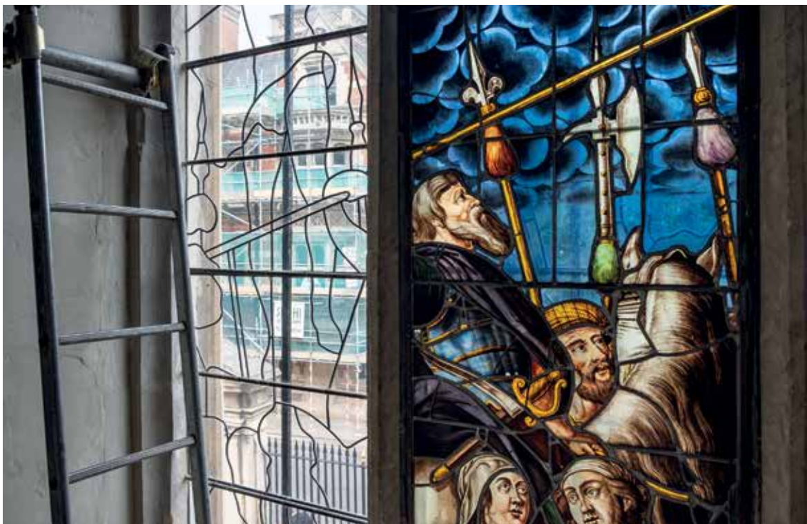
Before and after: the restored glass being reinstalled