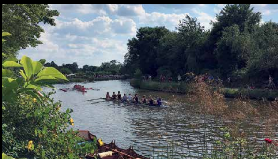
View from Fen Ditton

We will be holding a dinner in Manchester in 2020, with a return to a London venue in 2021.