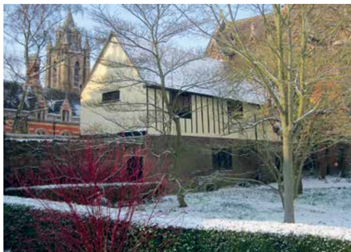
The Brewhouse in the snow

Once refurbished, the Brewhouse will provide space for a new office for the Director of Music, a recital room and a practice room. Planning permission has now been approved and we are hoping to begin work in 2020. Once we know what the project will cost we will launch an appeal, but we are grateful for all the donations and pledges already received.