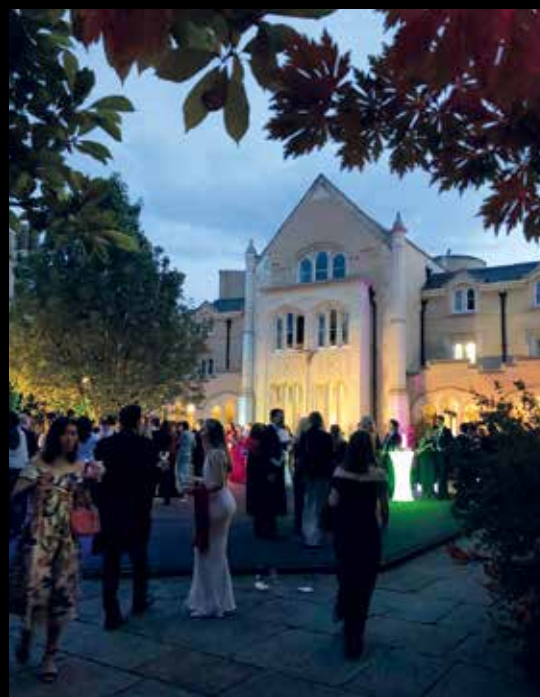
Gisborne Court lit up for the May Ball

Working closely with the May Ball Committee, the Development Team put together a VIP package especially for Petreans. These special tickets included the opportunity to meet with the Master and enjoy Champagne in the Lodge before heading across the road for early entry to the Ball itself. Once inside the Ball, Petreans had access to a special VIP lounge, where they could escape the hurly burly of the partying students and relax with a glass of Champagne. It was wonderful to see so many Petreans return to College for such a spectacular event and we hope for a repeat in 2021.